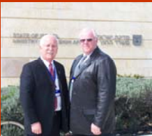
Israel Foreign Affairs