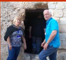
The Garden Tomb