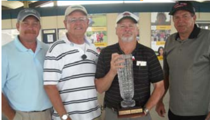
First Place Winners!