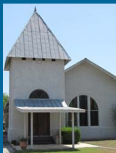
New Beginnings, Rio Frio