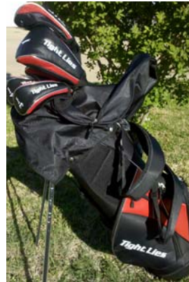
New "Tight Lies" golf bag and five matching covers