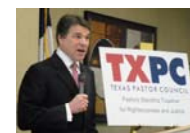
You have reason to be proud of your politically-incorrect governor. "People of faith must not be afraid to speak up."